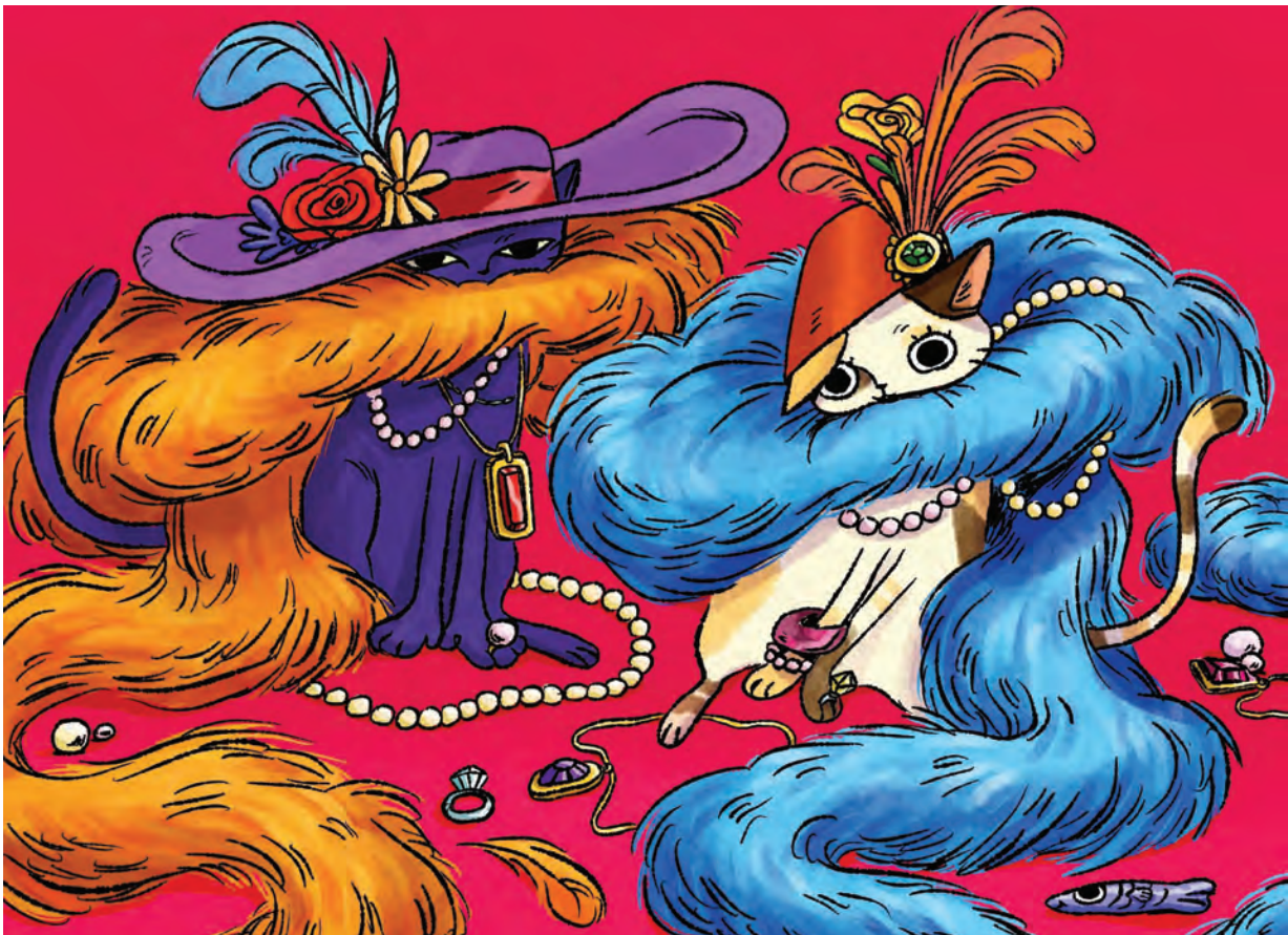
Monty Vaz, "Jiji & Sushi Dress Up"