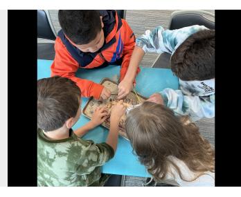
Fossil Dig at Illinois Reads