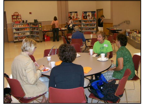
Area teachers enjoy conversation, collaboration, and breakfast before the sessions begin.

Even though our attendance was not as high as we had hoped, we feel that this was one of the best SIRC Mini Conferences yet! The SIRC board is weighing the possibility of changing the time of the year that we host a mini conference. What do you think? Email one of the co-presidents if you have a suggestion!