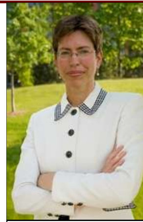
Lt. Governor Sheila Simon

With higher standards being made for Illinois schools, but less