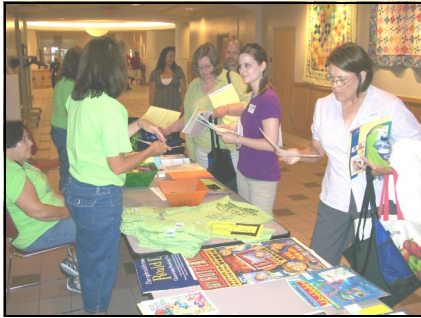
Conference attendees loved all of the door prizes that SIRC gave away!

Several educational professionals presented sessions. Topics included: Meeting the Core Standards, Technology for Today’s Classrooms, 2012 Rebecca Caudill Nominees, Great Elementary Books, Differentiated Learning, and Grouping in Elementary Classrooms.