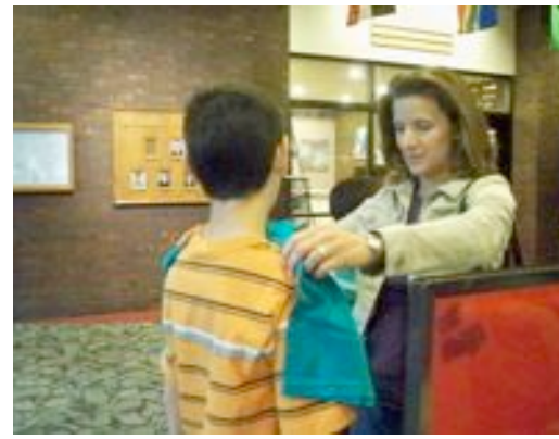
T Shirts and bags are great souvenirs.