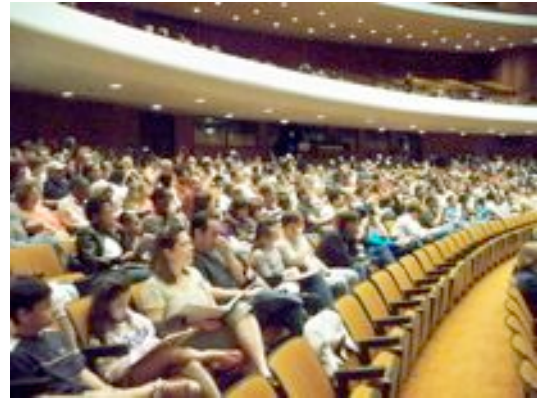
Everyone is welcomed at the opening ceremony.