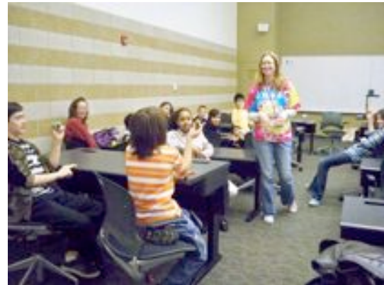
A volunteer group leader interacts with students.