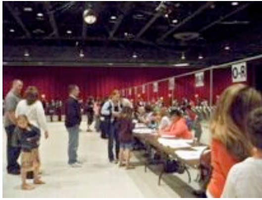
Students register and meet their group leaders.