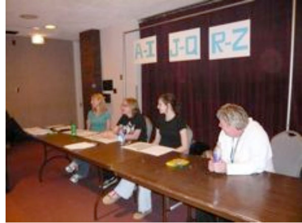
ILLC board members prepare for Friday night events. Volunteer materials are ready for pick-up at registration in Old Main at Illinois State University.