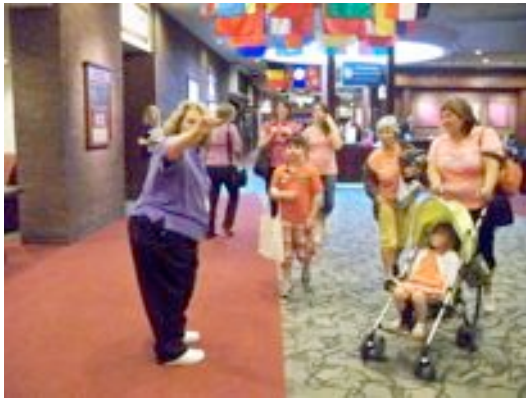
Board members help students and parents find their way to activities.