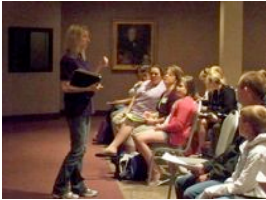
Saturday starts with volunteer orientation.